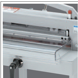
FRONT HAND GUARD