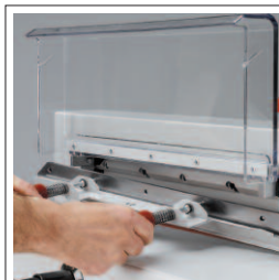
BLADE CHANGING DEVICE